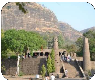
Patna Devi Temple

Zoology department is highly equipped with instruments and has university recognized research laboratory from 2007. Up till 08 students completed their M. Phil., and 10 research scholars completed their Ph.D. and 5 students are in the process of completion of their work. PG was started from 2017 and has been running smoothly.