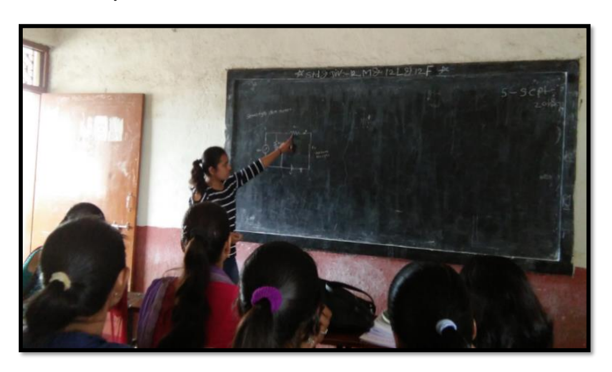
Presentation at Yuvati sabha Personality Development workshop