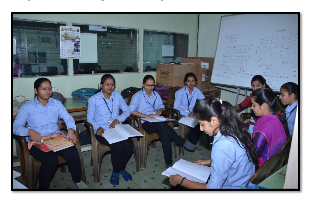
English Group Discussion